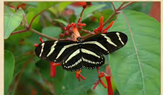
Zebra Swallowtail Butterfly sucks nectar from firebush.