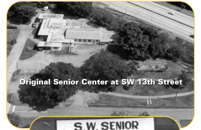
Original Senior Center at SW 13th Street