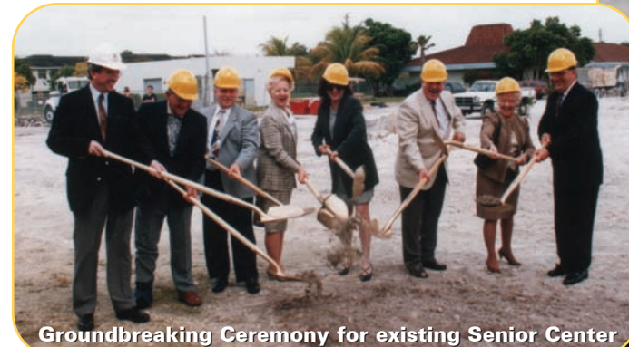
Groundbreaking Ceremony for existing Senior Center