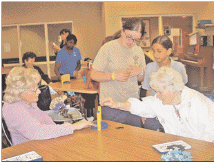
and elder care.