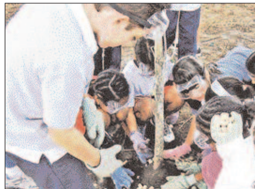
During the 1st annual Charter East Tree Planting, 4th grade students from the Pembroke Pines Charter School's East Campus got down and dirty, as they did their part to make a difference and help the planet.